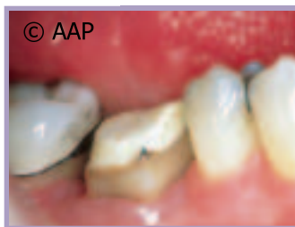
Crown lengthening exposes more of the tooth surface

Crown lengthening is a surgical procedure that recontours the gum tissue and often the underlying bone surrounding one or more teeth so that an adequate amount of healthy tooth