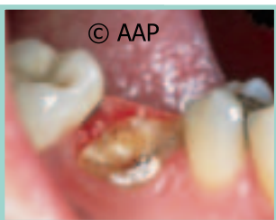
Decayed tooth prior to crown lengthening

Periodontal procedures are available to lay the groundwork for restorative and cosmetic dentistry and/or to improve the health and esthetics of your smile.