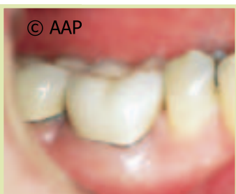
Crown is successfully placed

necessary space between the supporting bone and crown, preventing the new crown from damaging gum tissues and bone.